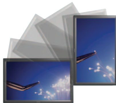
Content rotator for portrait use*