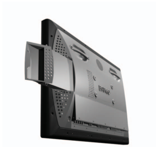
Fully featured compact PC*

Adapt the look and feel of your LCD to suit the design of your location. Optional extras include the possibility to order colors and patterns to suit your needs.